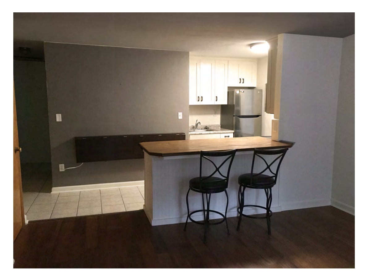
Kitchen/Dining Space (two chairs shown are included)

Apartment is available July 15, 2018. A year-long lease is required; no subletting, please. Please email Sarah at sek175@gmail.com to set up a viewing and to provide references.