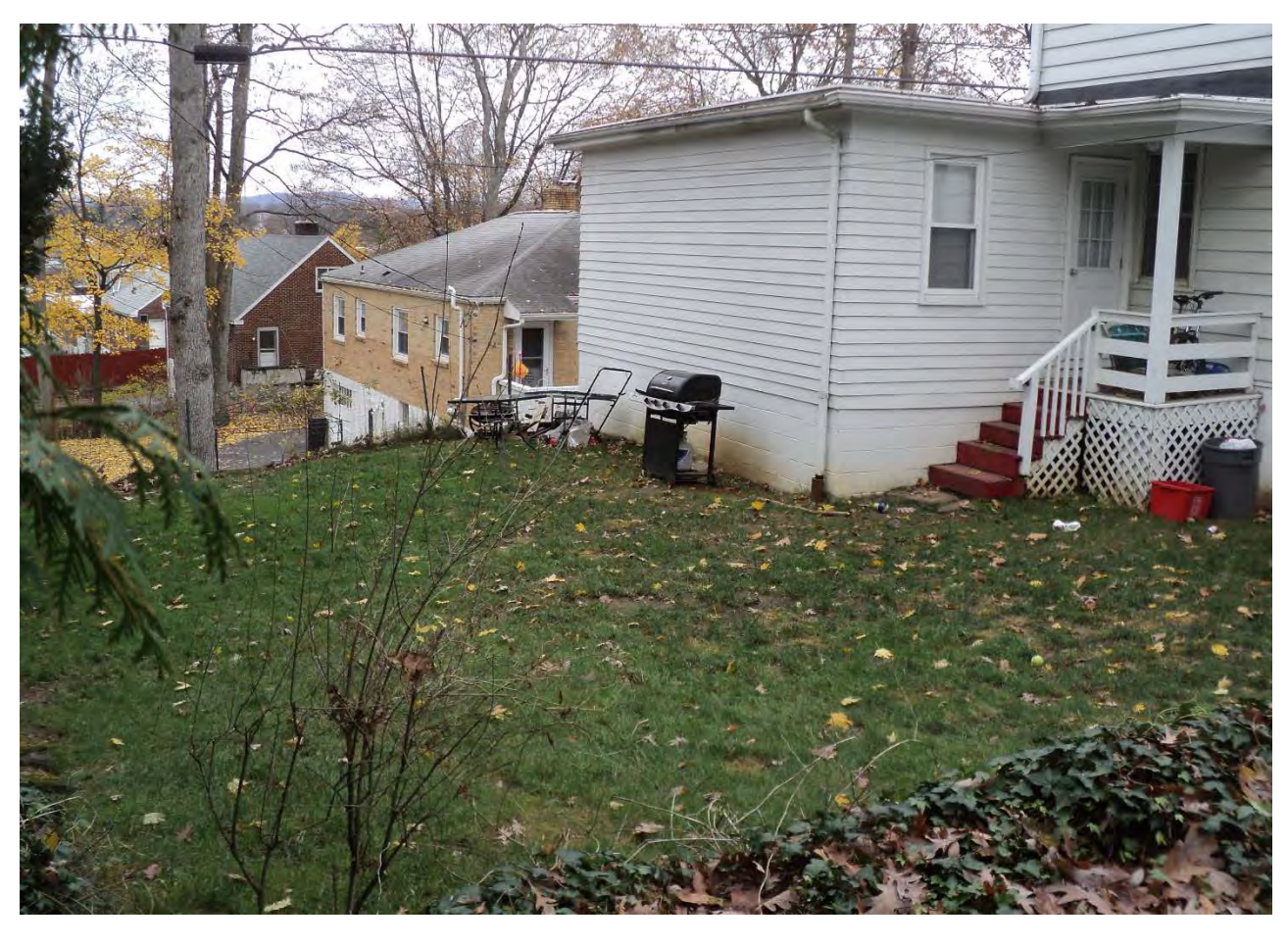
Back Entrance and ½ of Backyard