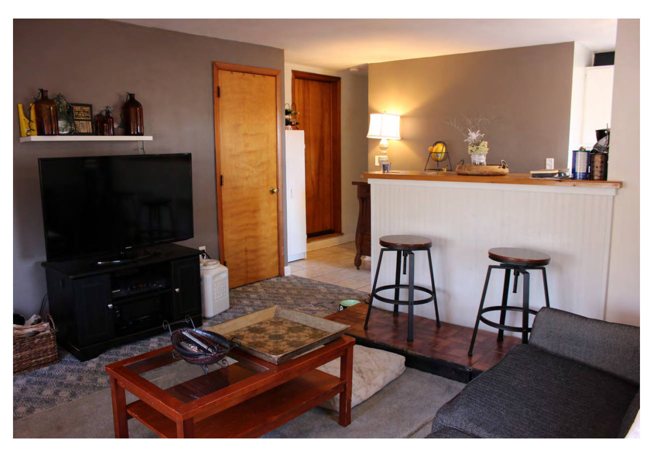
Living Room (prior to flooring upgrade & kitchen counter upgrade)