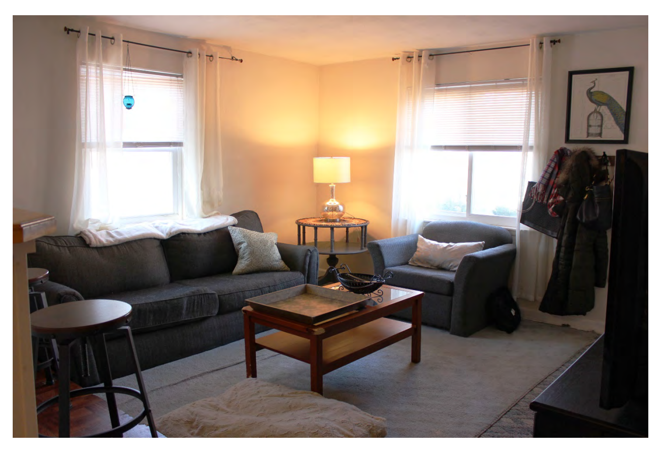
Living Room (~12'x13') (prior to flooring upgrade)